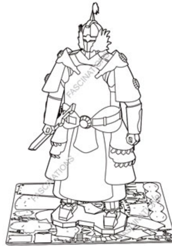
Chinese (Ming) Armor Item No. MMS141