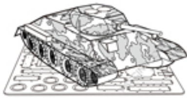
T-34 Tank Item No. MMS201