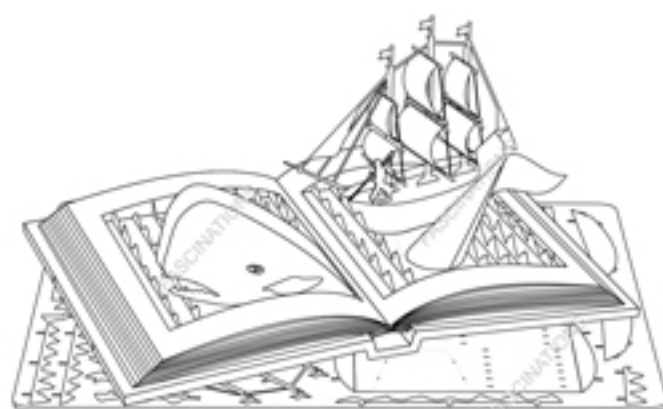
Moby Dick Book Sculpture