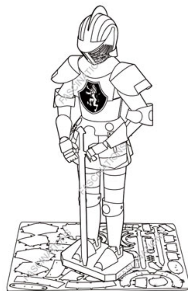
European Armor Item No. MMS142